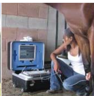
funding industry research