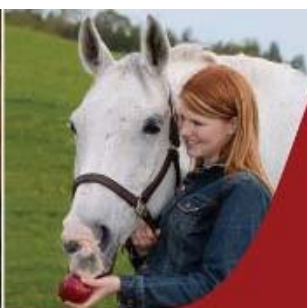
promoting health & performance